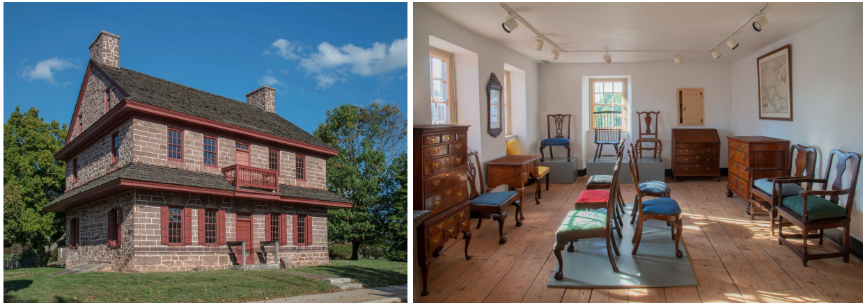
The Henry Muhlenberg House exterior and furniture gallery.